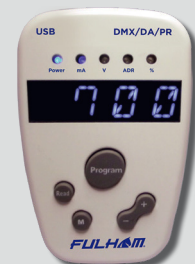
TPSB-100EU SmartSet Controller